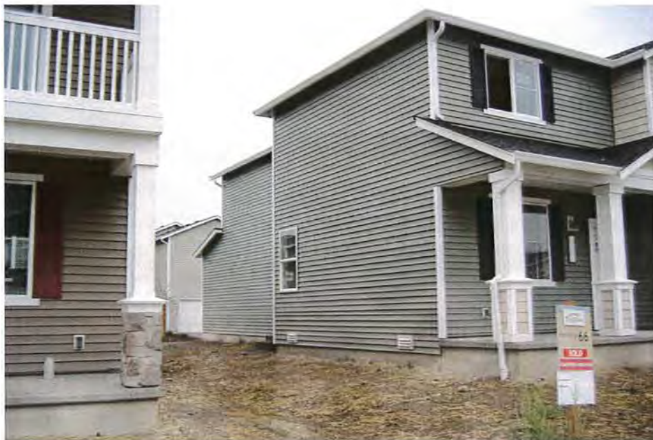
Lot 65 West Face 10-02-08