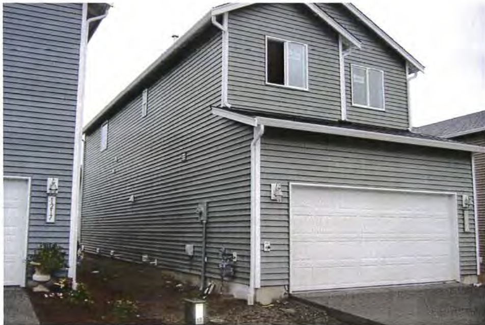
Lot 65 East Face 10-02-08