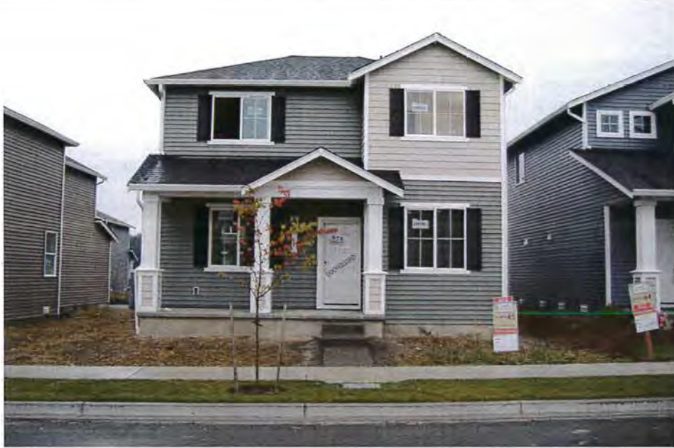
Lot 65 South Face 10-02-08

If using the Elevation Certificate to obtain NFIP flood insurance, affix at least two building photographs below according to the instructions for Item A6. Identify all photographs with: date taken; "Front View" and "Rear View"; and, if required, "Right Side View" and "Left Side View." If submitting more photographs than will fit on this page, use the Continuation Page, following.