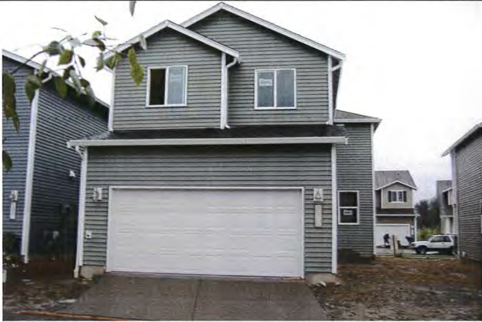
Lot 65 North Face 10-02-08

If submitting more photographs than will fit on the preceding page, affix the additional photographs below. Identify all photographs with: date taken; "Front View" and "Rear View"; and, if required, "Right Side View" and "Left Side View."